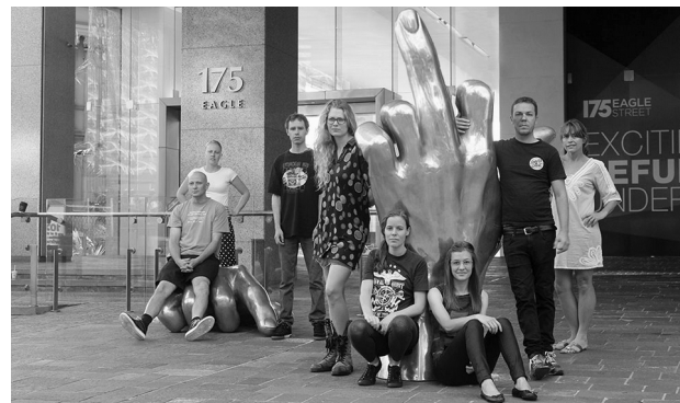
Who took this photograph?

In 2009, a group of Brisbane-based artists (known collectively amongst themselves as Fingers —after a music event, Fingers für Deutschland , held in Jorg Immendorf's studio in 1980 which included Werner Büttner, Walter Dahn, Jiří Georg Dokoupil, Gerard Kever, Martin Kippenberger and others) travelled to Rainbow Beach. Eight people in total, plus swimwear and sweet and savoury pierogi, across three cars.